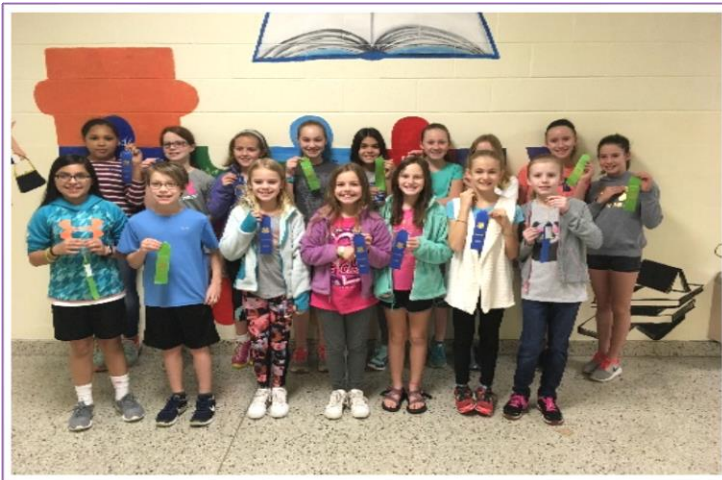
WES 4-H Club Members